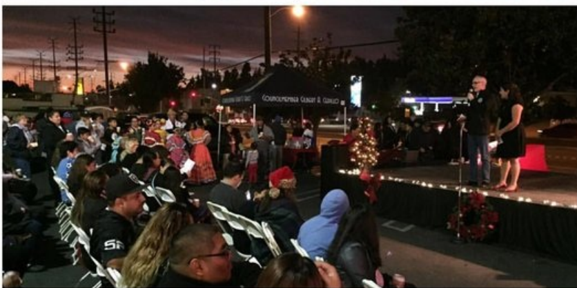
Dorris Place Elementary Winter Program